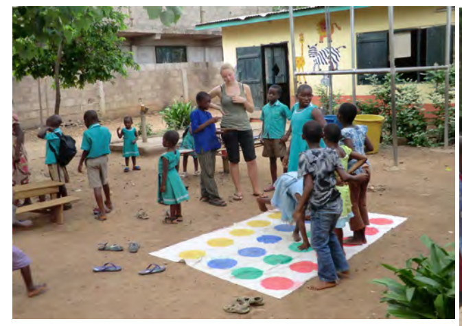
Illustration 2: Volunteer playing 'Twister' with them

told me about several football matches they had played and a trip to the monkey sanctuary they had taken.