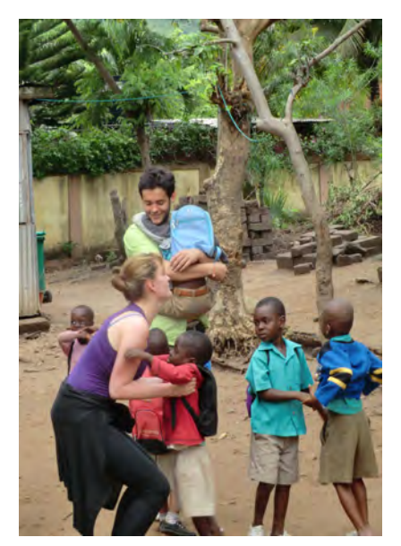
Illustration 4: Children clinging

The children got attached quiet quickly and many young girls would frequently cling to one's arms (see Illustrations 4 and 5).