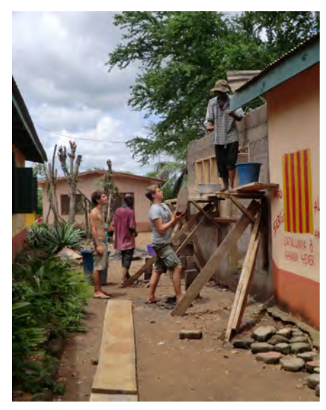
Illustration 6: Volunteers working on the construction of a new library/computer room

donate supplies and money, but the founder was apparently not able to manage it well so that he decided to make it an NGO policy to give her food and supplies rather than money. For each entire year, the local coordinator decides on one particular construction project that is funded through the program fee donations. Thus, one single construction project is finished per year, in this case a library/computer room for the orphanage (Illustration 6).