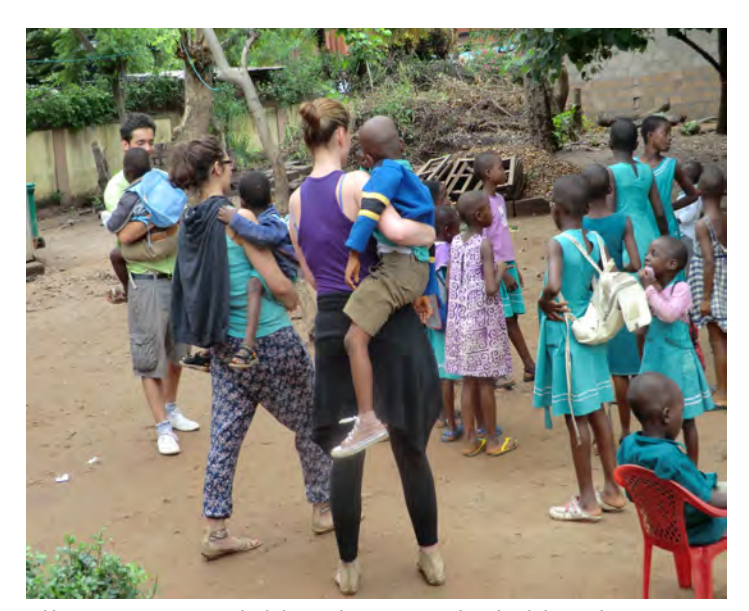
Illustration 5: Children happy to be held and hugged