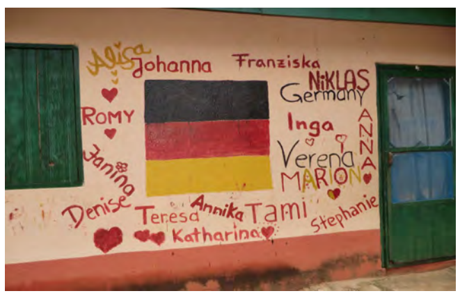
Illustration 1: German Volunteers Flag Wall

Their experience has taught them that volunteers are there for a short time to play with them and give them presents. As a result, they confront the volunteers with this expectation, especially on the day of departure. I observed this on the last day of a female long-term volunteer: They immediately ran up to her asking for goodbye presents and when she left, they did not show any emotional reaction since the new volunteers and I had already arrived (Field notes, 24.05.2012). However, they are indeed sad when volunteers leave, but do not cry every time, only for those that they got attached to due to extreme commitment or a long duration of stay. In most cases, when volunteers would leave, they would expect goodbye presents in the form of sweets and consumable things, would remind the volunteer to write his/her name on the wall (see photo) near his or her home country's flag and then say goodbye. They would not seem sad for long because of the distraction of the constant flow of new arrivals. Since there were always volunteers around, they were never completely alone and happy about every visitor that would come by.