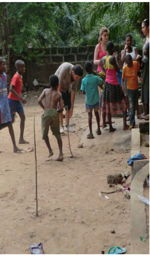
Illustration 3: Volunteer building a goal using wooden sticks

"Volunteers provide them with fun activities and experiences they probably would not have if volunteers would not come" (Field notes, 18.05.2012)